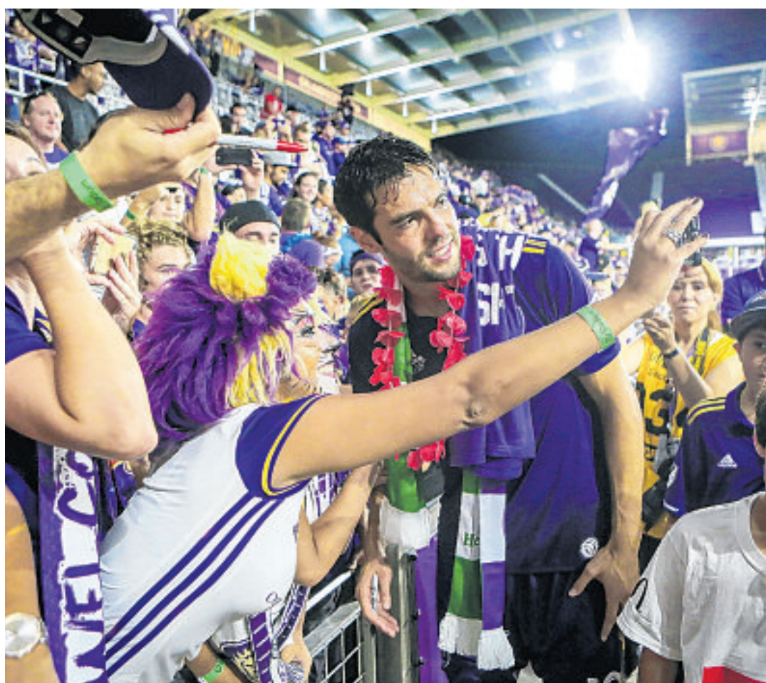
Orlando City's team captain, Kaká, hugs, signs autographs and poses with fans after the team's final home game of the season against Columbus on Sunday evening. The Lions lost to the Crew 1-0.

Kaká's emotions strong throughout the game, C1 . ■ Lions leave striker Cyle Larin off roster, C4